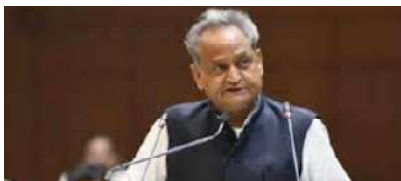
Indira Rasoi Yojana

Chief Minister Ashok Gehlot directed officials to start the Indira Rasoi Yojana in urban areas of Rajasthan from August 20.